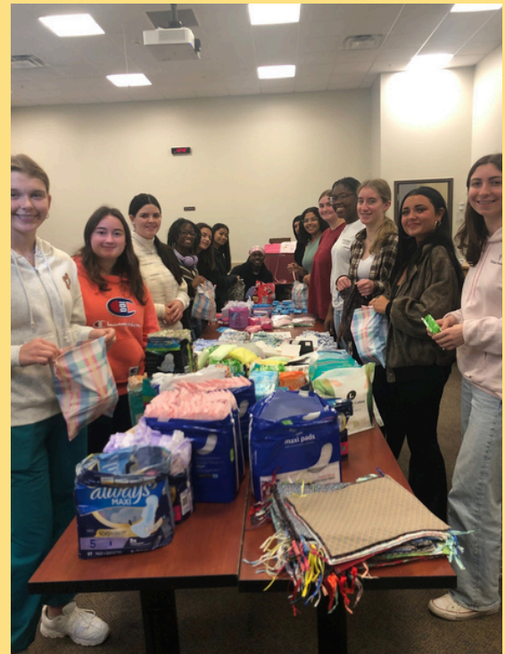
Members of St. John Fisher University Feminist Alliance donated this year's kits to World Relief Western NY

Groups scheduled to hold parties in 2025 are ShinShinim Jewish Federation Israeli Emissaries, the Church of Jesus Christ of Latter Day Saints, Pittsford Women's Club, Barrington Park Neighbors, Temple Beth El Sisterhood and SJFU Feminist Alliance. Temple Sinai Sisterhood will hold an independent party in March.