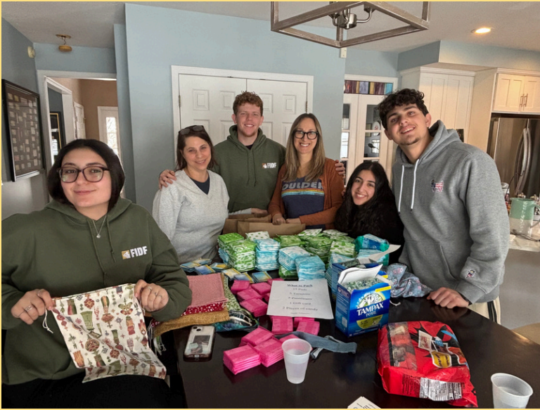
Rochester ShinShinim learn about P.A.D. while making kits for Baden Street Settlement

P.A.D. provides access and dignity to those who menstruate by supplying kits containing pads, tampons, party liners, and chocolate! This offers individuals an opportunity to continue to go to work or school without the burden of cost associated with these products.